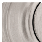
Satin Nickel 15