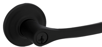
Henley Lever with SmartKey Security in Matte Black