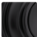
Matte Black 514