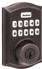
Venetian Bronze 11P