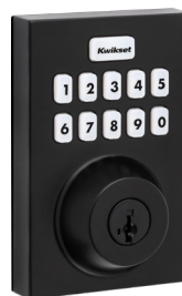
Matte Black 514