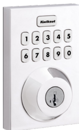
Polished Chrome 26