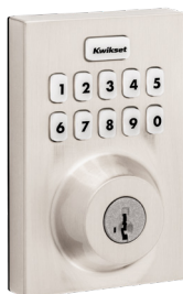
Satin Nickel 15