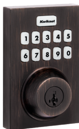
Venetian Bronze 11P