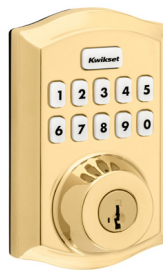
Polished Brass 3