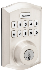
Satin Nickel 15