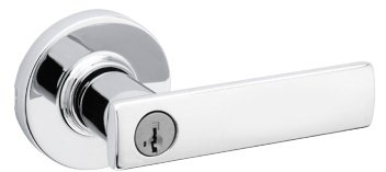
Breton Lever with SmartKey Security round rose in Polished Chrome