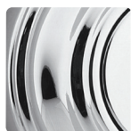
Polished Chrome 26