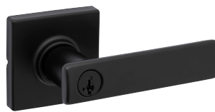
Breton Lever with Smartkey Security contemporary square rose in Matte Black