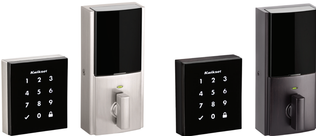
Satin Nickel 15