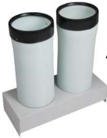
Air Chutes - Conditioned air supply, equipped.