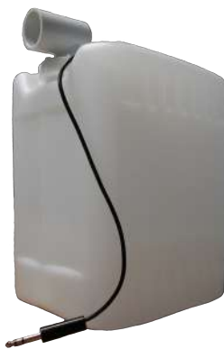
Condensate Tank - 3-gal Condensate Tank with float assembly for automatic cutoff.