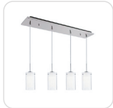
MP41304BN-04 Brushed Nickel

LED pendant fixture with cylindrical glass shade plus concentric cylindrical diffuse white inner shade. Minimal clear glass styling plus brushed nickel finish makes Verona suitable for a host of interior applications. The inner shade removes all glare from the LED source and makes Verona ideal for lighting small dining tables - or use in multiples over larger countertops. Available in two sizes, please view series for more details.