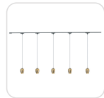
TR5C-P89703-BG Brushed Gold