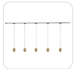
TR5C4-P89703-BG Brushed Gold