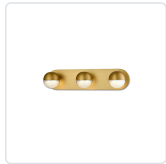
VL47321-BG Brushed Gold