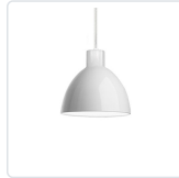
PD1706-WG Glossy White