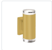
601432BG-LED Brushed Gold