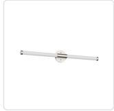
VL18532-BN Brushed Nickel