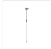
PD75027-BG Brushed Gold