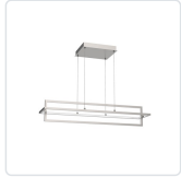
LP16236-BN Brushed Nickel