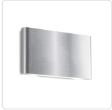
AT68010-BN Brushed Nickel

This minimalist sleek cast-aluminum wall sconce is a beautiful addition to any indoor or outdoor application. Finished with a high-end brushed nickel, powder-coated white or black cast-aluminum, rectangular in size with smooth, sleek, rounded corners. Premium frosted optical lenses, which emits the light from the fixture evenly against the wall.