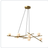
CH89854-BG/GO Brushed Gold/Glossy Opal Glass