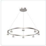
CH19933-BN Brushed Nickel

Multiple aluminum cones are connected inline and direct light downwards from the geometric linear pendant. The Dune series utilizes classic minimalist lamp shapes yet in reduced scale to elegant effect. The LED spot sources are focused by diminutive reflectors housed within the exquisitely turned shades. Available in multiple configurations and finishes.