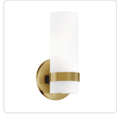
WS9809-BG Brushed Gold

A sleek cylinder 9 inches long conceals the LED light source allowing for an even light distribution, like a scroll of paper that glows with mystery inside. There are no hotspots in this wall sconce, only an ambient glow. The opal glass is attached by a ring of brushed nickel, chrome, or brushed gold scroll and affixed to the wall by a matching circular metal disk.