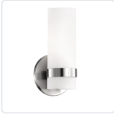
WS9809-BN Brushed Nickel