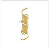
WS93730-AN Antique Brass

A looping radiant line casts light across space in a continuous helical path. The Synergy series is characterized by the rolled rectangular extrusion, which emits soft light through the silicon opal lens. Configured in both linear and ring arrangements, the arcing aluminum allows the curated finishes to be visible at every angle.