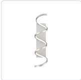
WS93730-AS Antique Silver