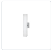
WS8418-BN Brushed Nickel