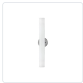
WS8324-BN Brushed Nickel