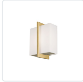
WS39210-BG Brushed Gold