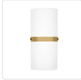
WS3413-BG Brushed Gold