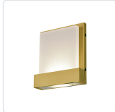
WS33407-BG Brushed Gold