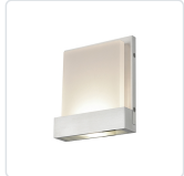
WS33407-BN Brushed Nickel

Implementing an edge-lit LED optical assembly results in a singular plane of diffusive glowing luminance. The GUIDE interior wall lamp obscures the radiant source within a precision-machined aluminum body. Slightly offset from the wall the orthogonal reductive fixture provides an optimal architectural accent. Custom patterns or text may replace the uniform translucence of the light guide.