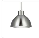
PD1709-BN Brushed Nickel