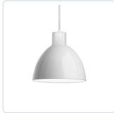
PD1709-WG Glossy White