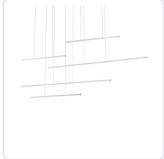
MP18363-BN Brushed Nickel

A cluster of disparate glowing lines have the appearance of levitation and movement, each element suspended by exceedingly fine cables. In a singular instance, the Vega Motion multi-pendant is a sculptural composition and, when used in tandem, an architectural installation. Available in two sizes and three finishes.