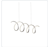
LP93742-AS Antique Silver

A looping radiant line casts light across space in a continuous helical path. The Synergy series is characterized by the rolled rectangular extrusion, which emits soft light through the silicon opal lens. Configured in both linear and ring arrangements, the arcing aluminum allows the curated finishes to be visible at every angle.