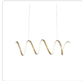
LP93742-AN Antique Brass