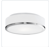
FM6012-BN Brushed Nickel