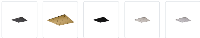
CNP16AC-BC Black Chrome