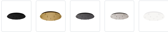
CNP09AC-BK Black CNP09AC-BG Brushed Gold CNP09AC-BC Black Chrome CNP09AC-BN Brushed Nickel CNP09AC-WH White