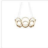
CH94824-AN Antique Brass