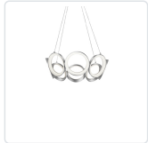
CH94824-AS Antique Silver

Die-cast aluminum rings with translucent acrylic diffusers. Metallic brushed or matte powder-coat finish. Outward emitting light. Custom options available.