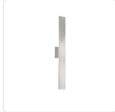
AT7928-BN Brushed Nickel