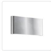
AT6510-BN Brushed Nickel