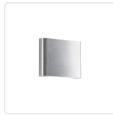
AT6506-BN Brushed Nickel