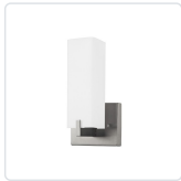
601485BN-LED Brushed Nickel