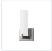
601484BN-LED Brushed Nickel