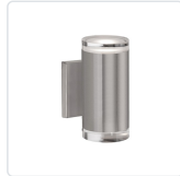
601432BN-LED Brushed Nickel