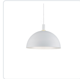
492324-WH/GD White with Gold detail