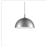
492324-BN/BK Brushed Nickel with Black detail