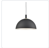
492324-BK/GD Black with Gold detail

Single-lamp pendant with aluminum dome shade showcasing powder-coated or plated finishes with metal details and a matte white interior. Exterior shade colors are black, brushed nickel, or white. Suspended by cloth cable. Available in three sizes.