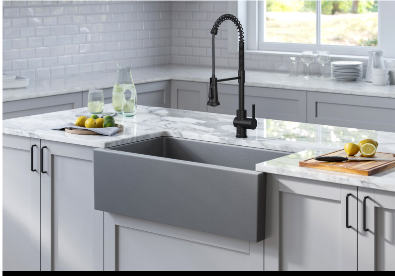
Turino™ 33" Fireclay Farmhouse Kitchen Sink (KFR1-33MGR)