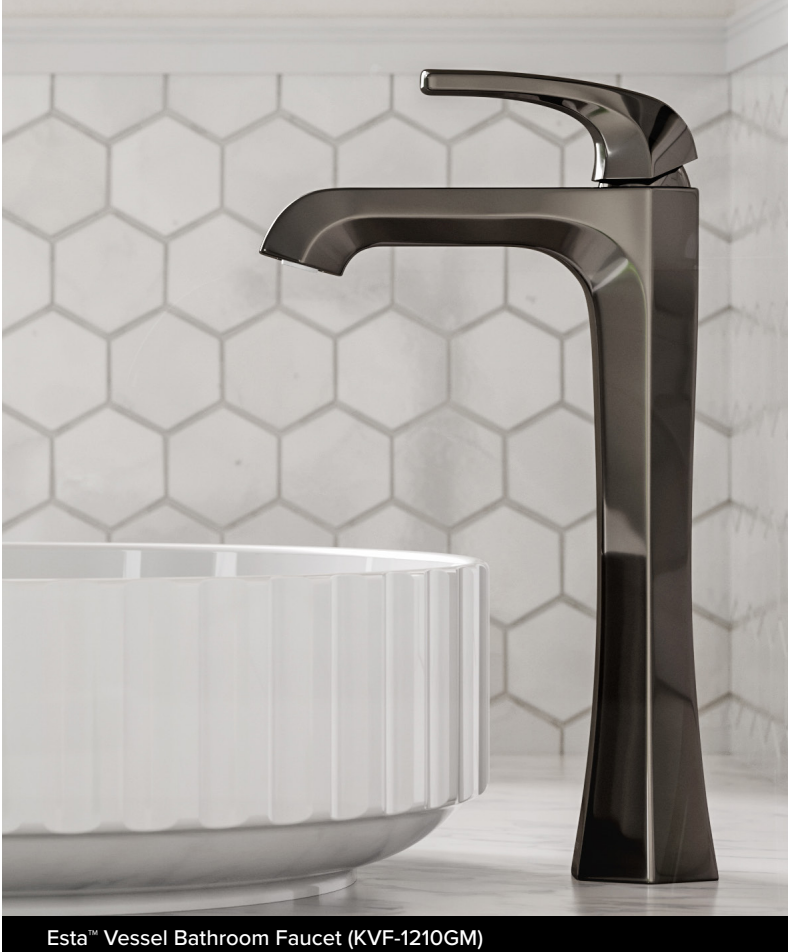
Esta Vesser Bathroom radeet (RVI 1210 OM)