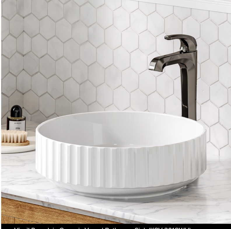
Viva™ Porcelain Ceramic Vessel Bathroom Sink (KCV-201GWH)