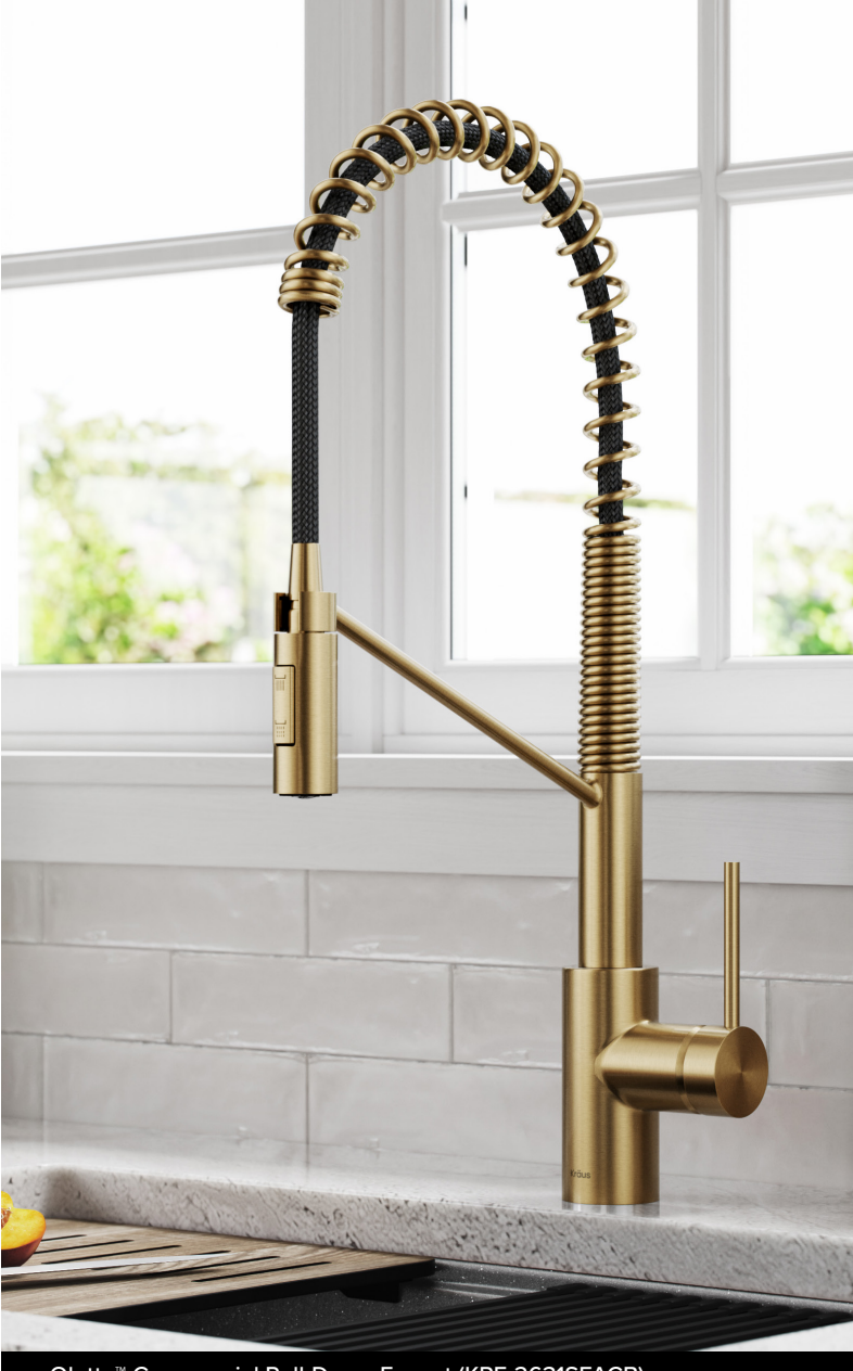
Oletto™ Commercial Pull-Down Faucet (KPF-2631SFACB)