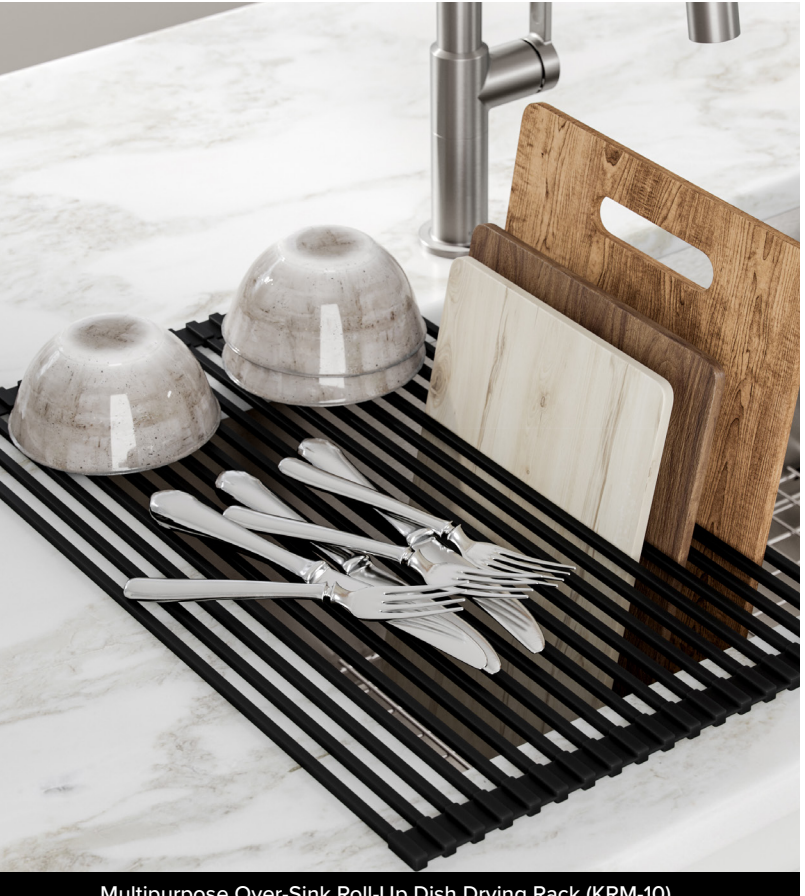
Multipurpose Over-Sink Roll-Up Dish Drying Rack (KRM-10)