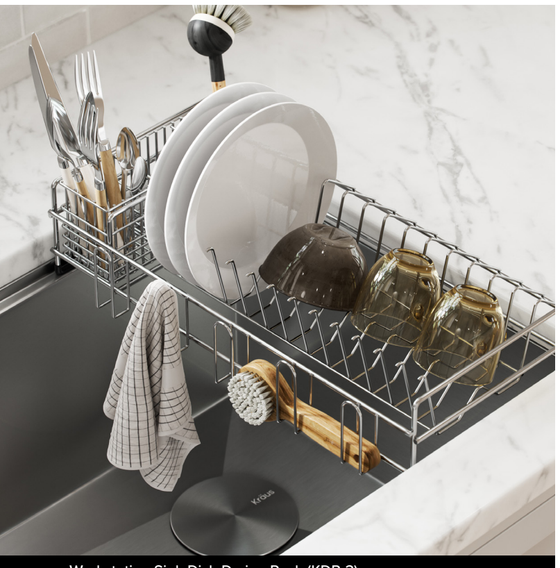
Workstation Sink Dish Drying Rack (KDR-3)