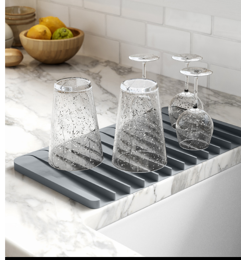
Self-Draining Silicone Dish Drying Mat (KDM-10)