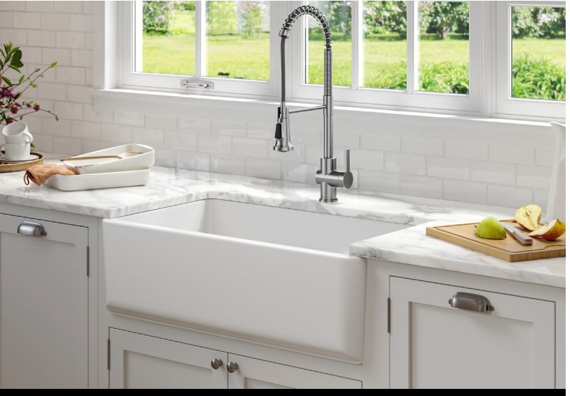
Turino™ 33" Fireclay Farmhouse Kitchen Sink (KFR1-33MWH)