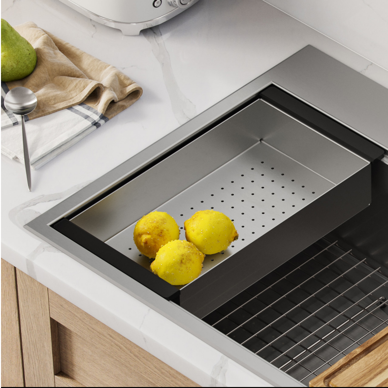
Stainless Steel Colander for Workstation Sink(CS-6)