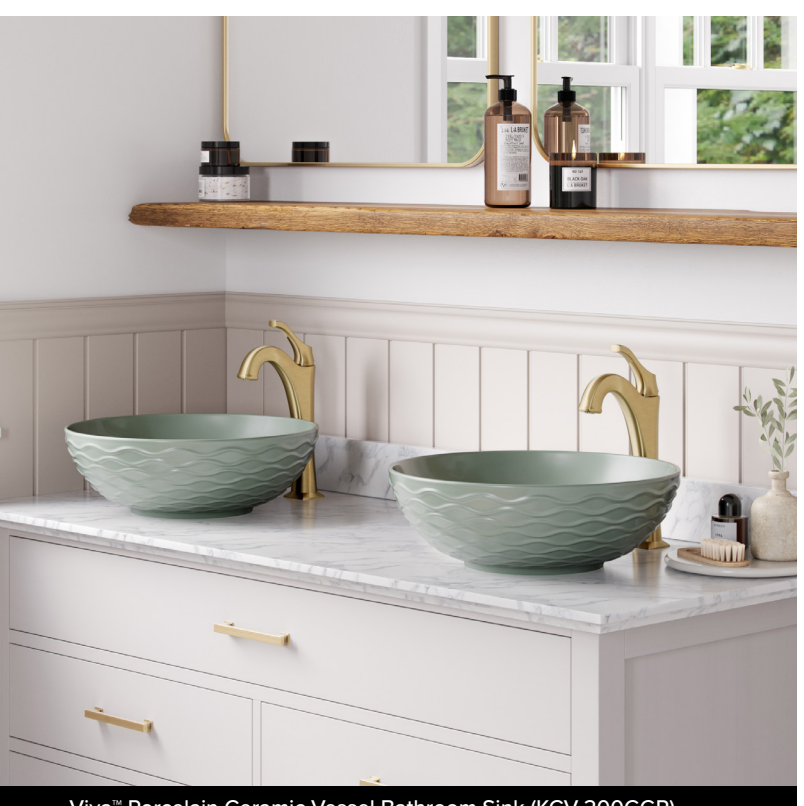
Viva™ Porcelain Ceramic Vessel Bathroom Sink (KCV-200GGR)