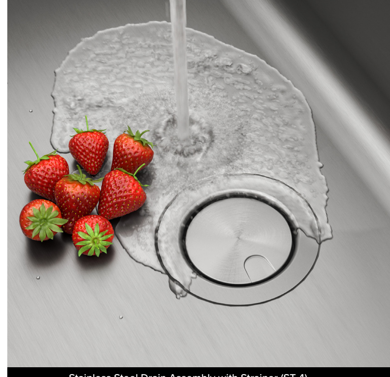
Stainless Steel Drain Assembly with Strainer (ST-4)