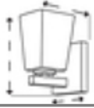
Image File Name: P4015-084.jpg