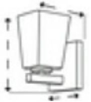
Image File Name: P5046-077.jpg