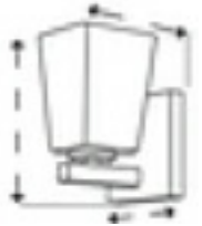
Image File Name: P5044-37B.jpg