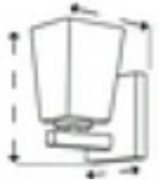
Image File Name: P5044-084.jpg