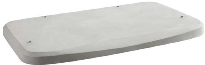
Models 14/20RESA/RESAL, 20RESC/RESCL