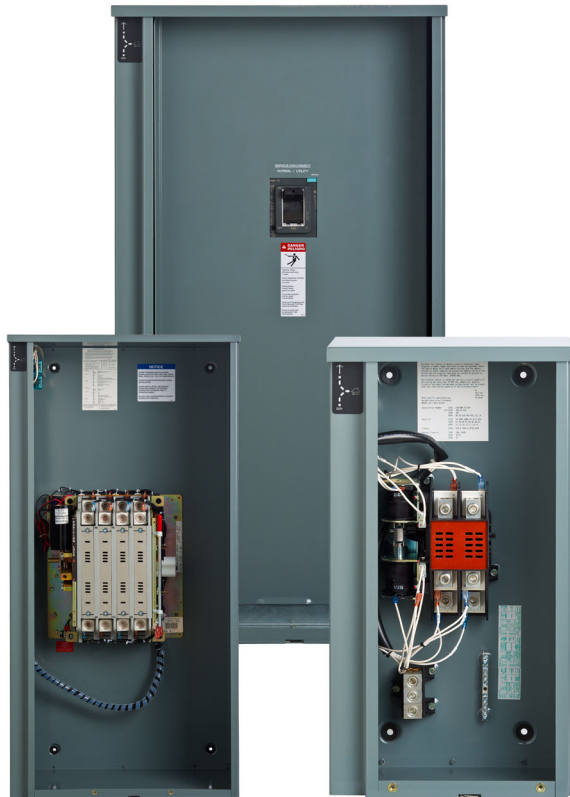
Covers have been removed for illustration.