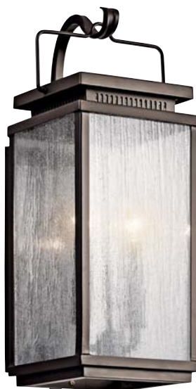
C | 49385 OZ