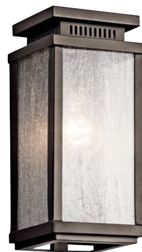
D | 49384 OZ