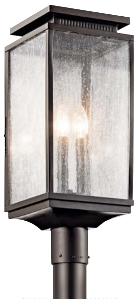
E | 49388 OZ Post Lantern