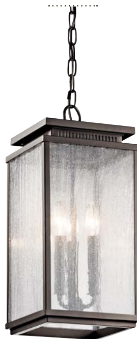
F | 49387 OZ Outdoor Pendant