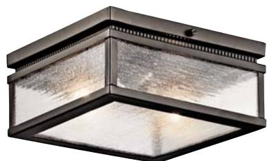
B | 49389 OZ Outdoor Ceiling