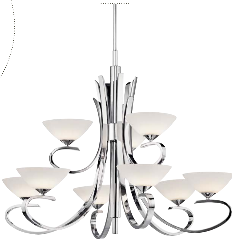
C | 43023 CH Chandelier