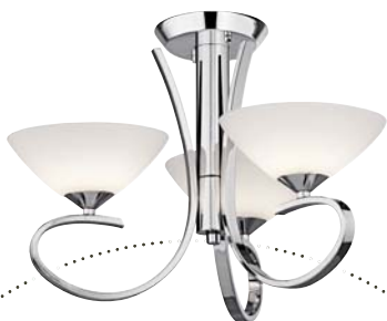
Shown as Semi Flush - 12" H.

POLISHED CHROME FINISH WITH SATIN-ETCHED CASSED OPAL GLASS