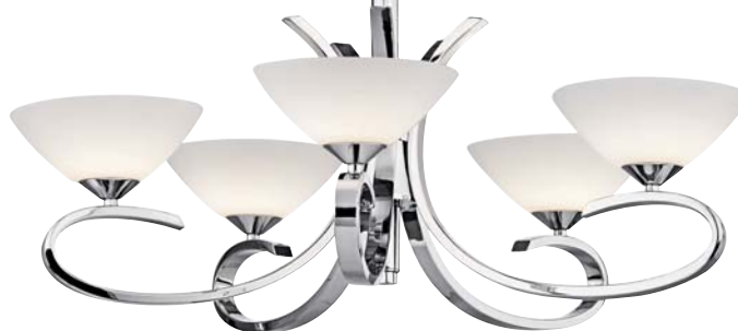
B | 43021 CH Chandelier