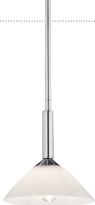
A | 43024 CH Mini Pendant

POLISHED CHROME FINISH WITH SATIN-ETCHED CASED OPAL GLASS