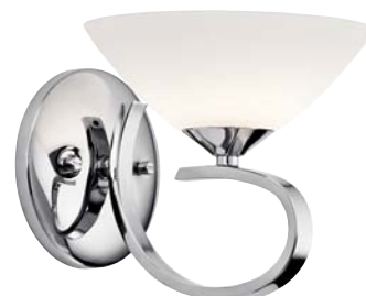
B | 45521 CH Wall Sconce