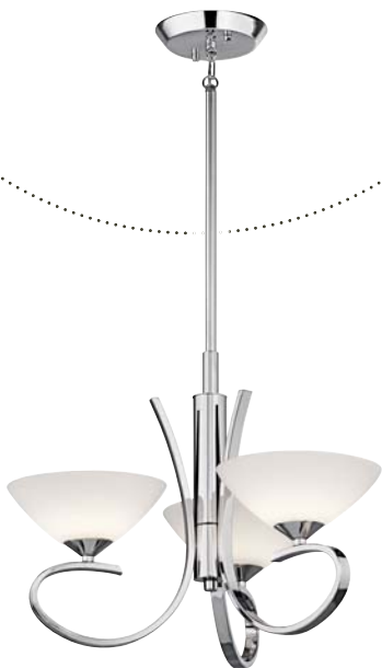
Shown as Mini Chandelier - 13" H.