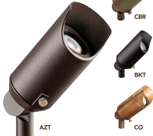
15384 AZT, AZT 24, BKT, BKT 24, CBR, CO