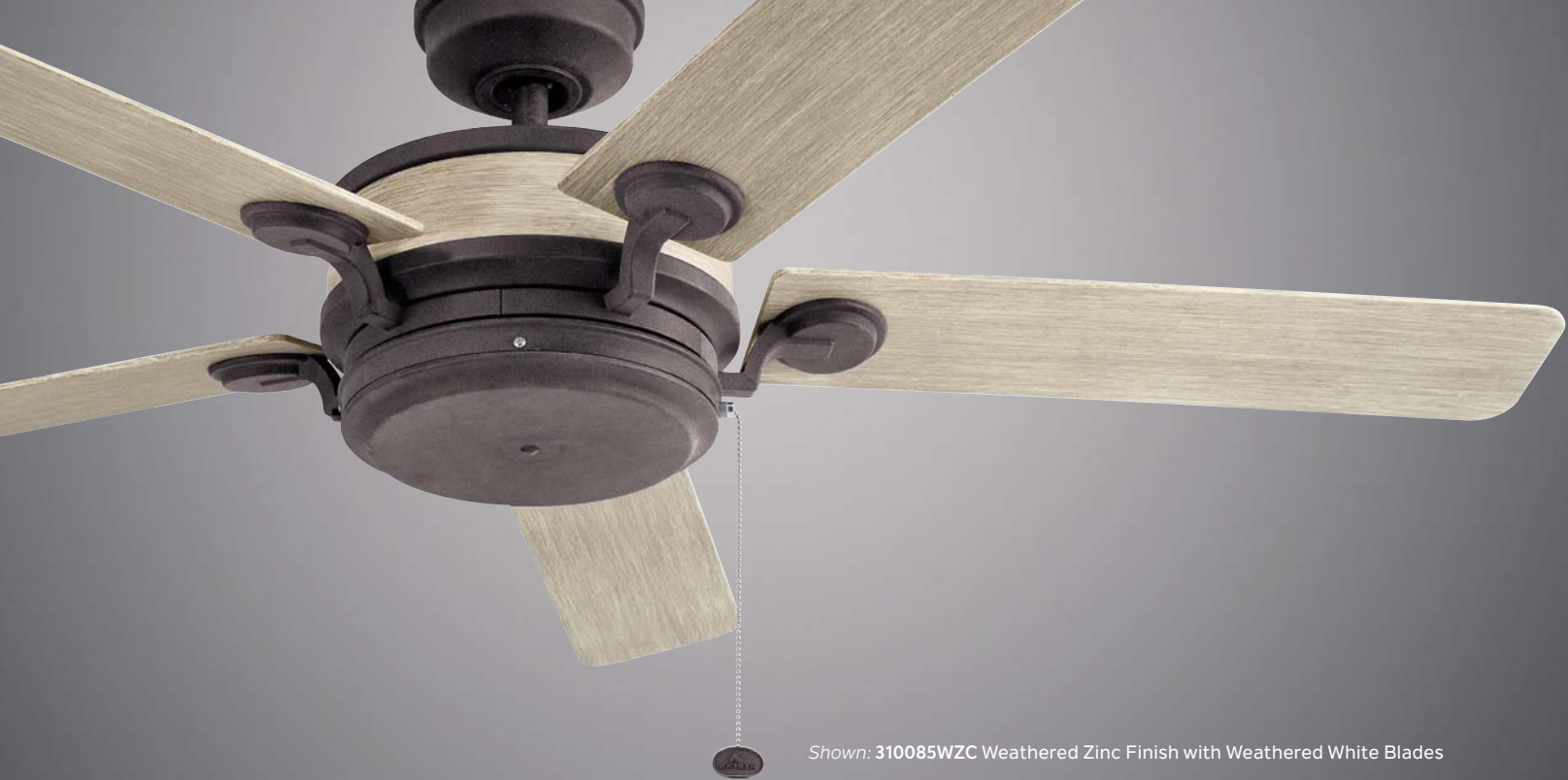
Shown: 310085WZC Weathered Zinc Finish with Weathered White Blades