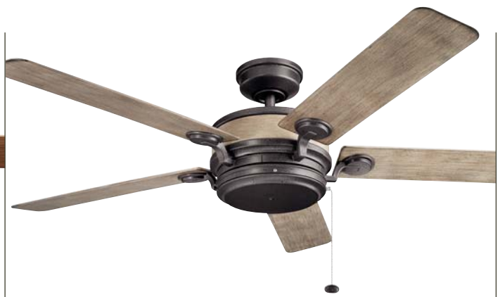
310085AVI Anvil Iron Finish Distressed Antique Gray Blades