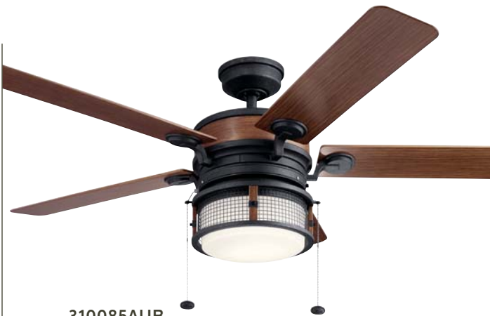
310085AUB Auburn Stained Finish Auburn Stained Blades