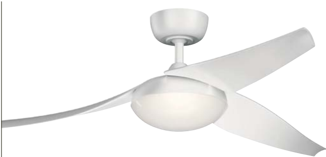
310700MWH Matte White Finish Matte White Blades