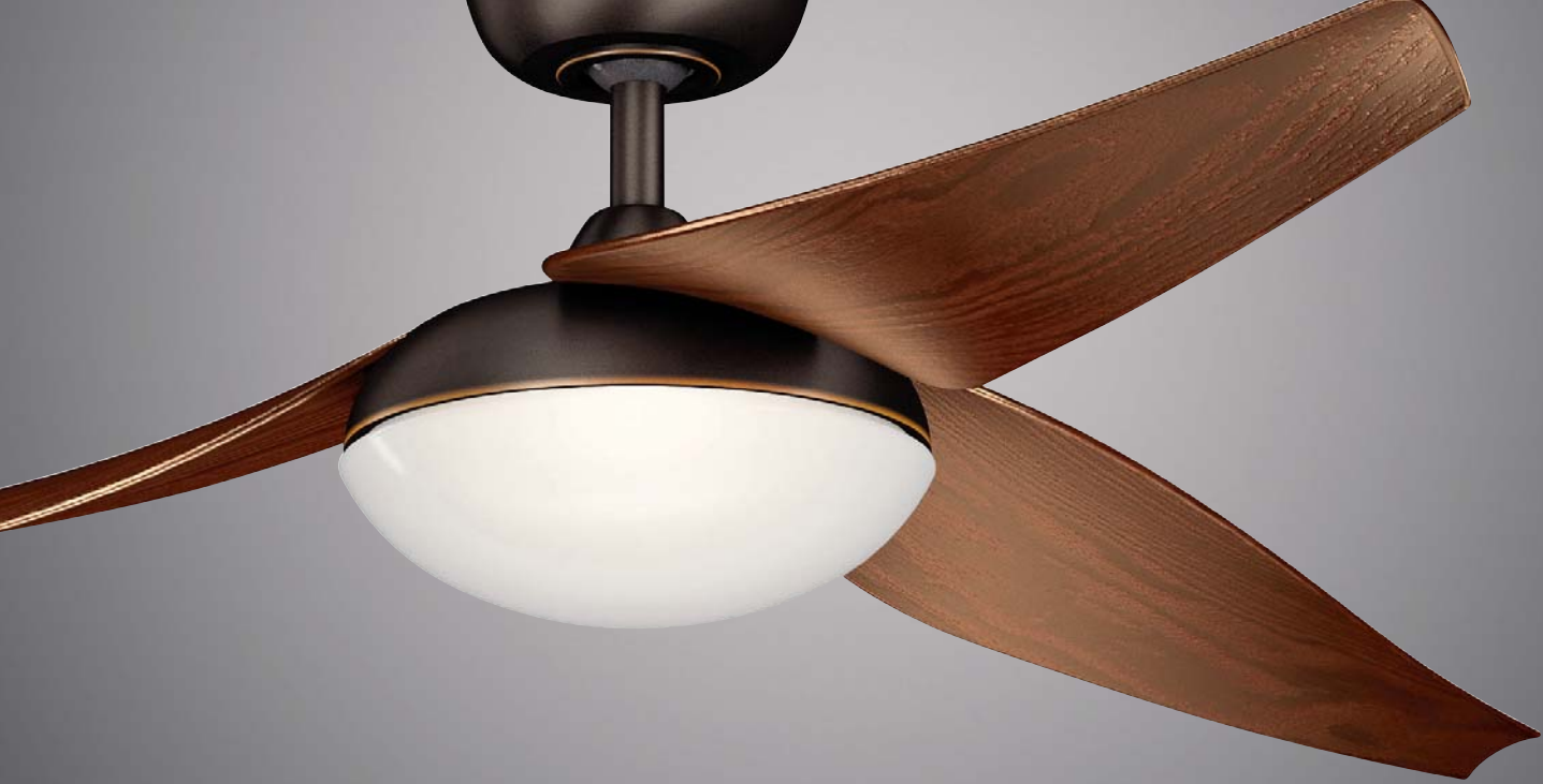
Shown: 310700OZ Olde Bronze® Finish with Walnut Blades