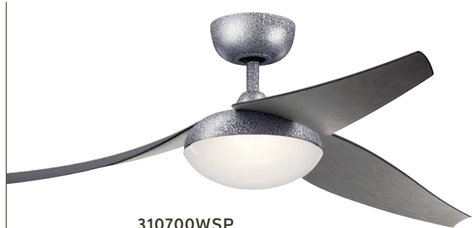
310700WSP Weathered Steel Finish Driftwood Blades