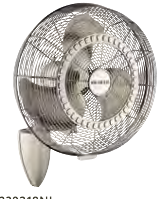
339218NI Brushed Nickel Finish Nickel Blades