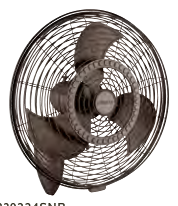
339224SNB Satin Natural Bronze Finish Satin Natural Bronze Blades